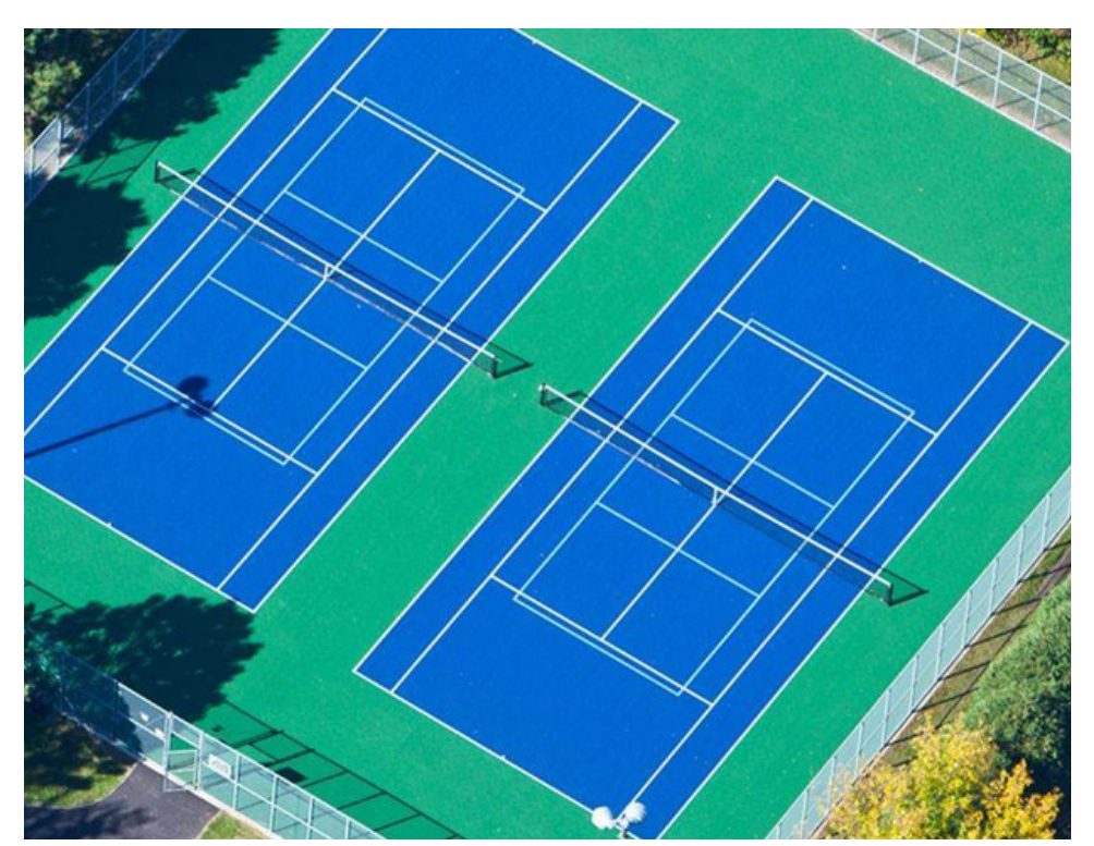
Resort-Style Pool with Day Beds Pickleball Courts