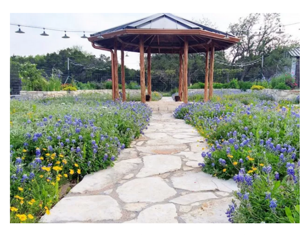
Yoga & Meditation Garden