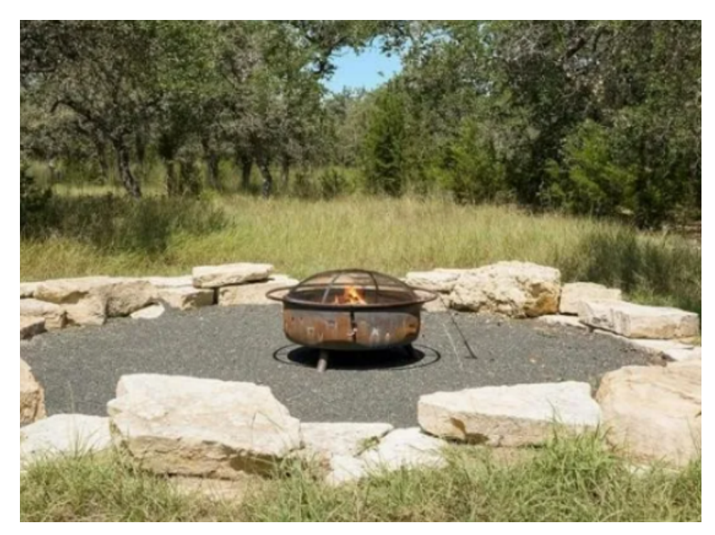
Firepits, Games, & Hiking Trail